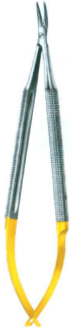
TCF-04-13 Barraquer Needle Holder (15cm)