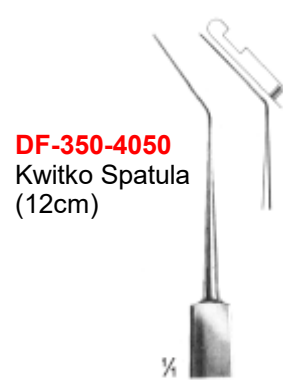
DF-350-4050 Kwitko Spatula (12cm)