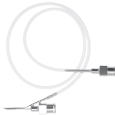
FSI-SIC-23 Simcoe Irrigation Cannula 23 gauges