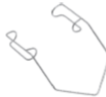
DF-333-3778 Barraquer Adult size (4cm)