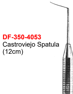
DF-350-4053 Castroviejo Spatula (12cm)