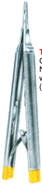
TCF-04-13B Castroviejo Needle Holder with lock (12.5cm)