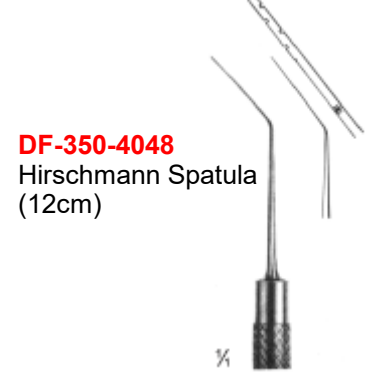
DF-350-4048 Hirschmann Spatula (12cm)